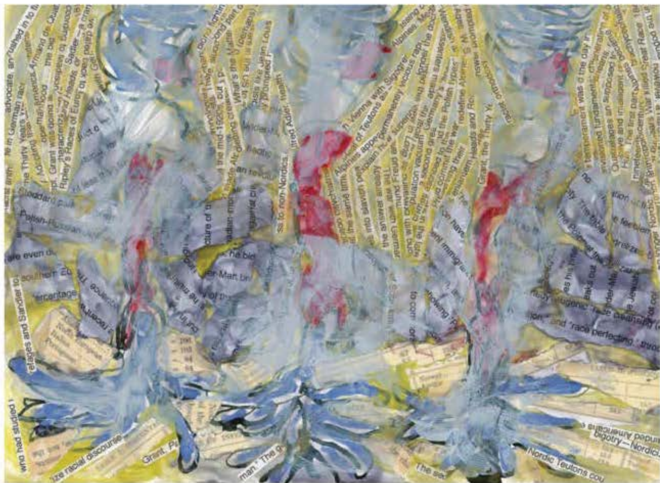
Unfashion 9 2010

My Unfashion and Plantain paintings opened the way for me to make digital collages, which I have continued to make to this day. Here's a drawing I made this spring at Yaddo to go with my Sojourner Truth essay in my forthcoming essay collection.