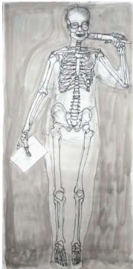
Self Portrait 2011

I can recommend any of the books on our long and short lists.