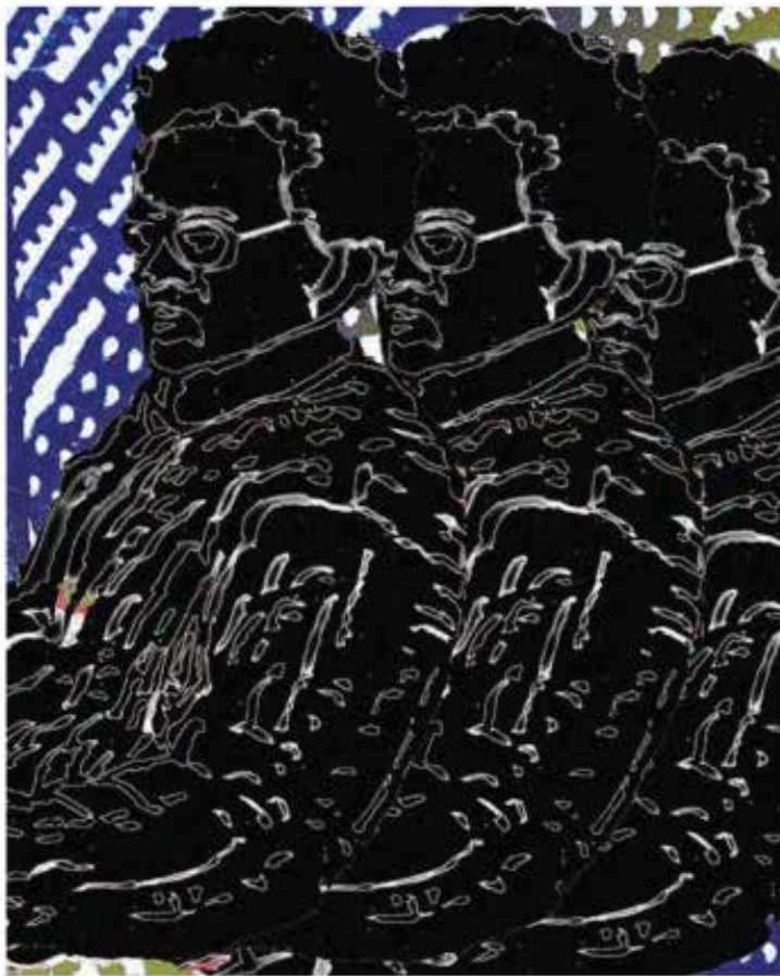
Black Nells with Fabric 2017