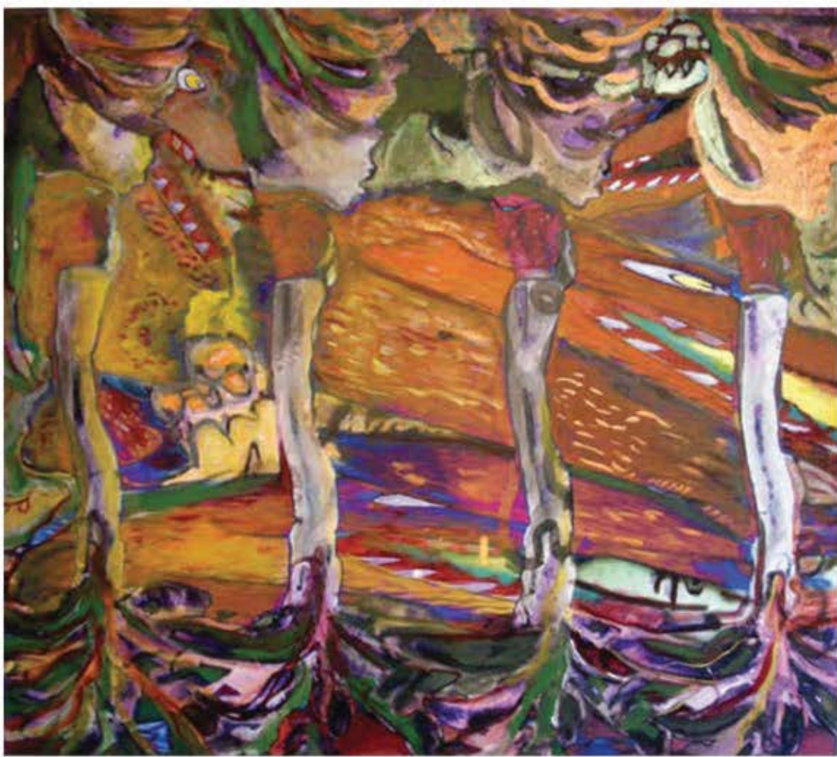
Plantains Solarized 2010

I had to tiptoe around the “I am.” If I were to use another person as a model, there might be issues of lightness and darkness as expressions of beauty and personal value. Another reason, besides my always being on hand, to use myself as a model. I don’t care how I depict me.