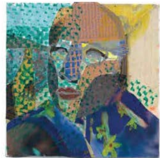
Triptyck #1, #2, #3 2011